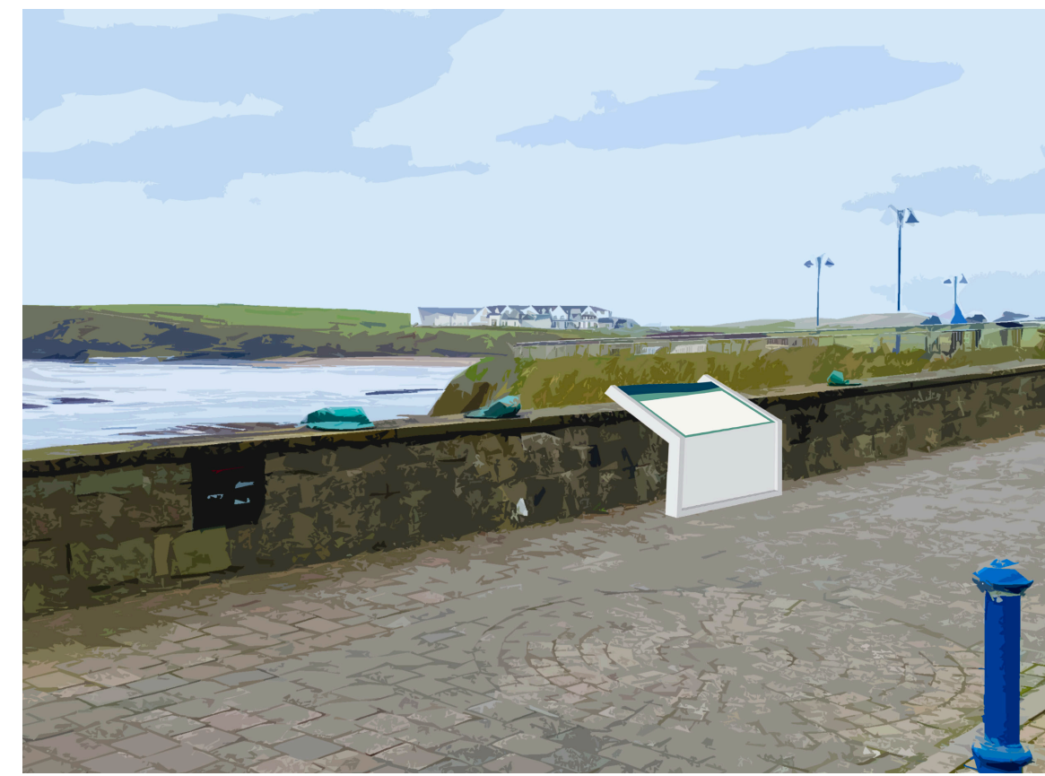
C4 - Thrupenny Pool