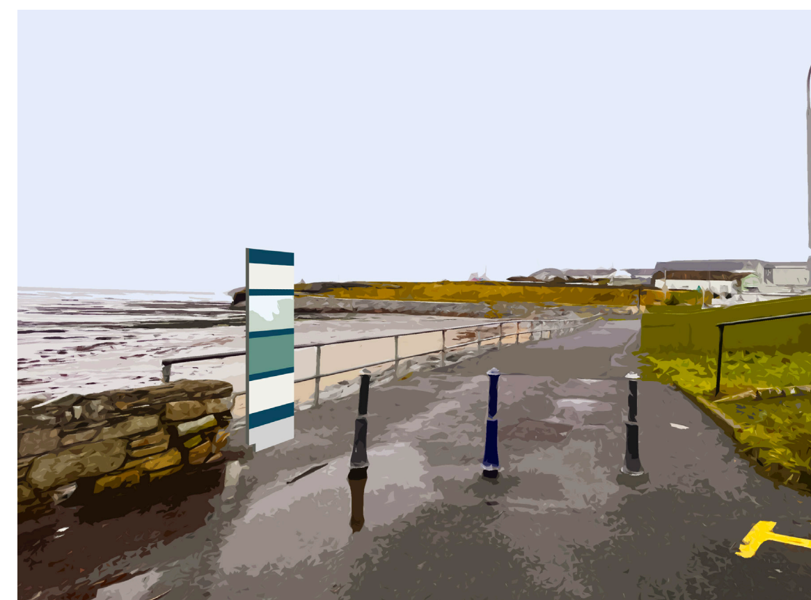
D5 - West End Car Park