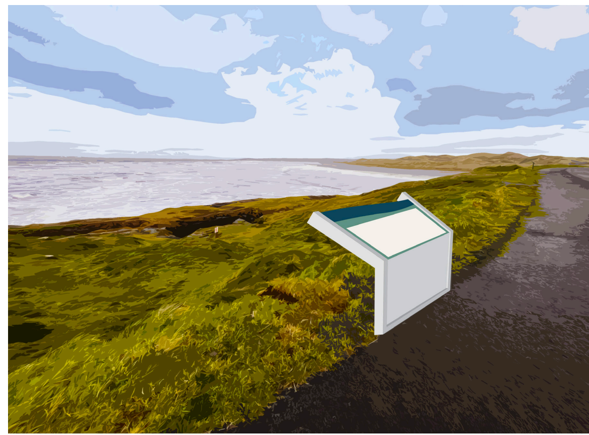
C2 - Fairy Bridges & Wishing Chair