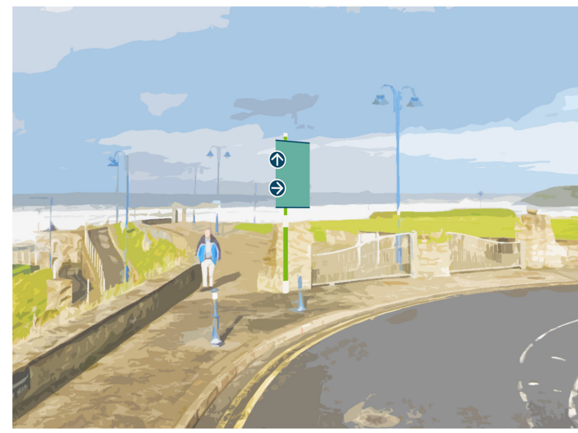
B9 - Beginning of Promenade