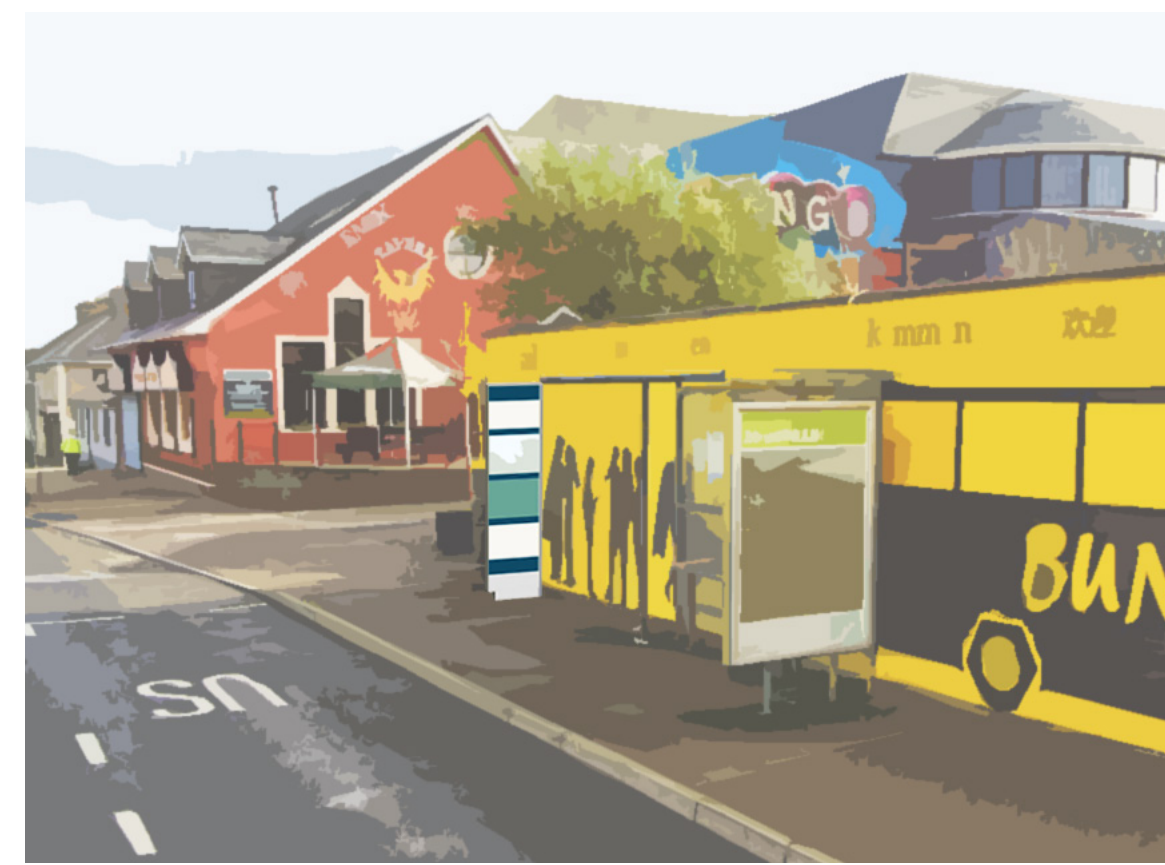
D1 - Main Street Bus Stop