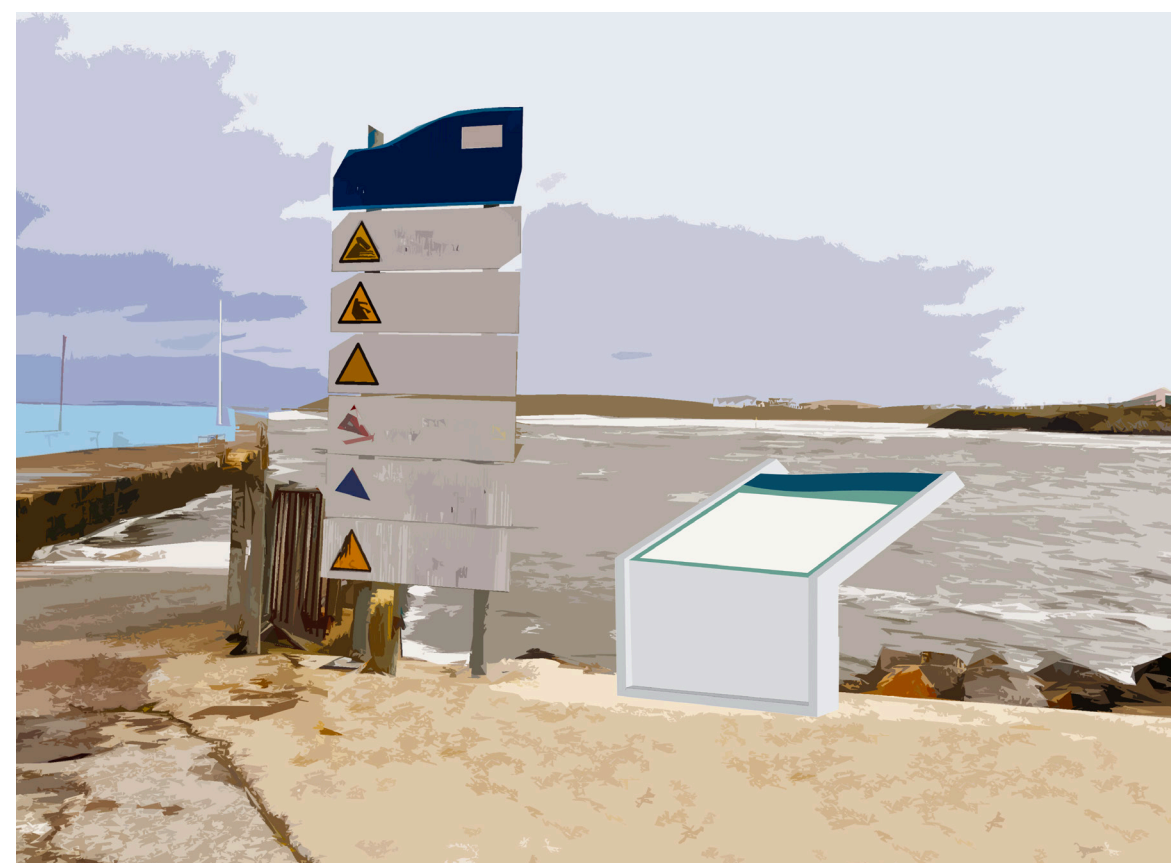
C6 - Pier & RNLI Station