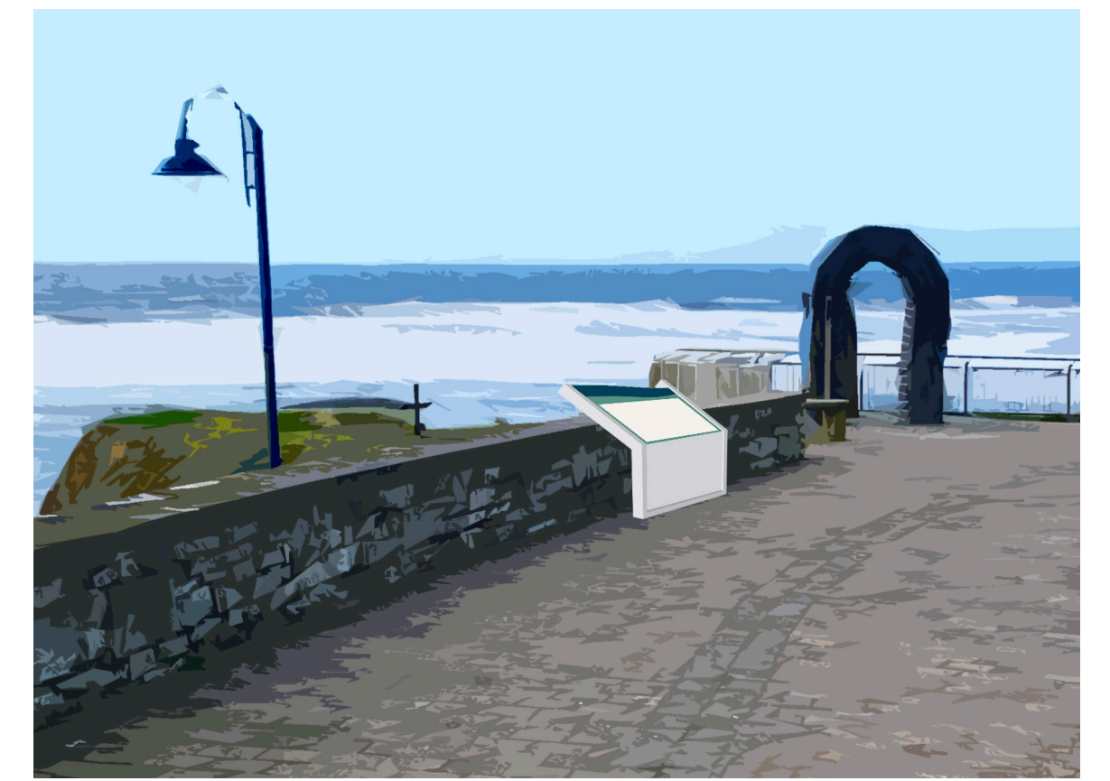
C5 - The Peak