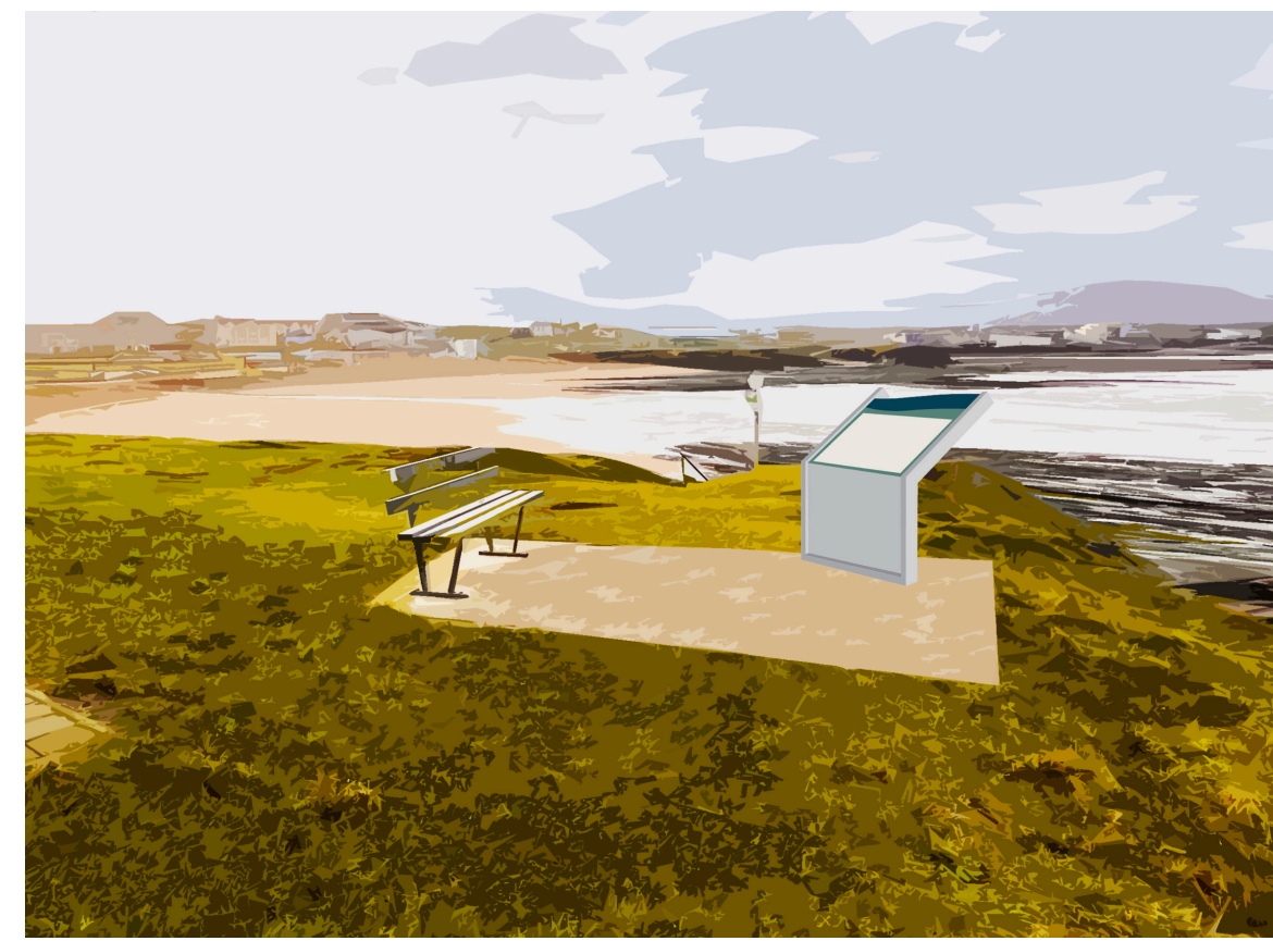
C3 - Rougey Cliffs