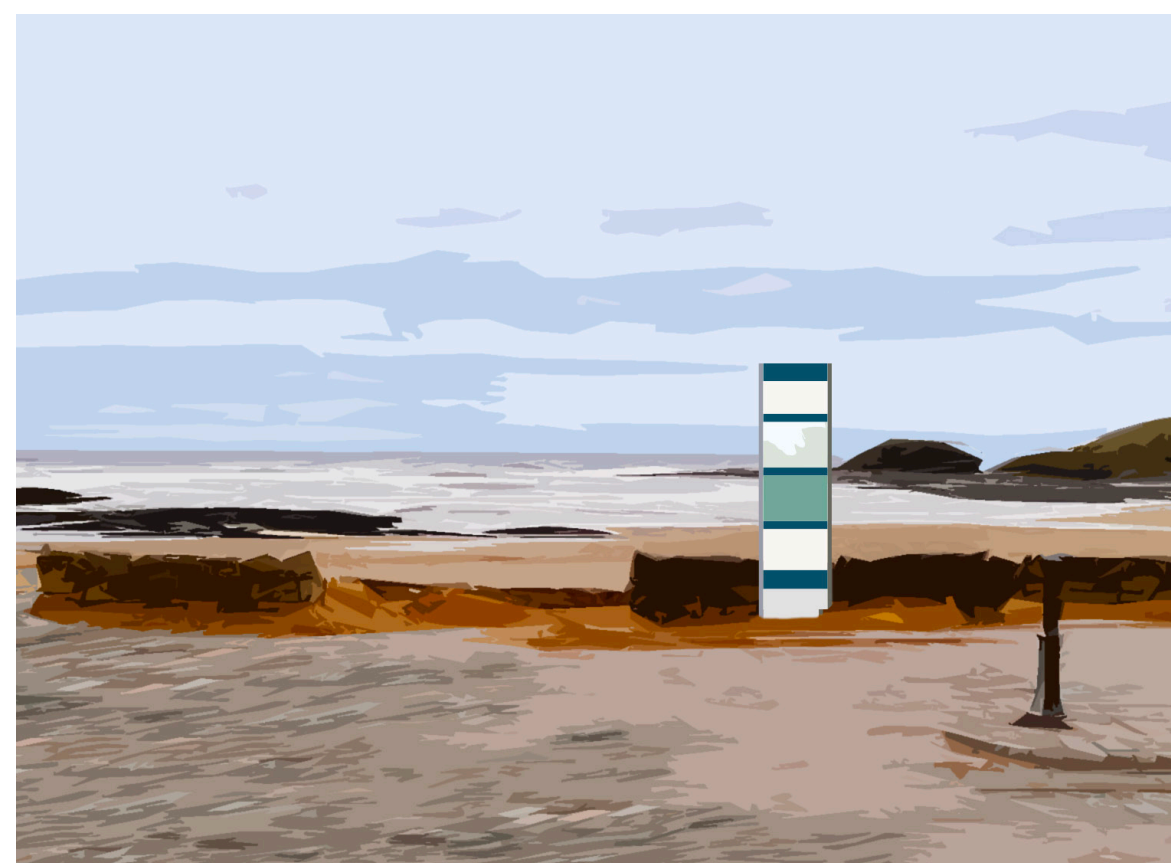
D3 - Main Beach