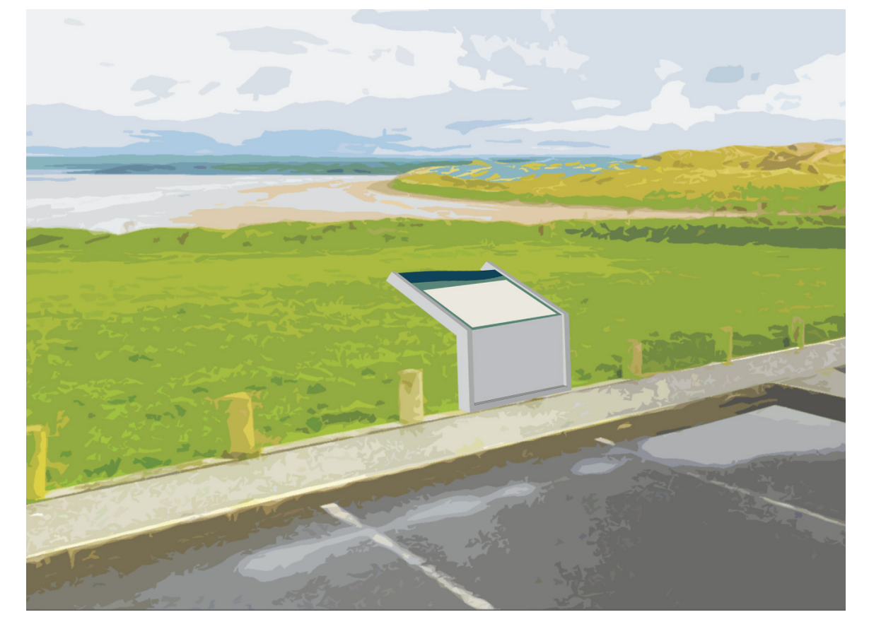
C1 - Tullan Strand