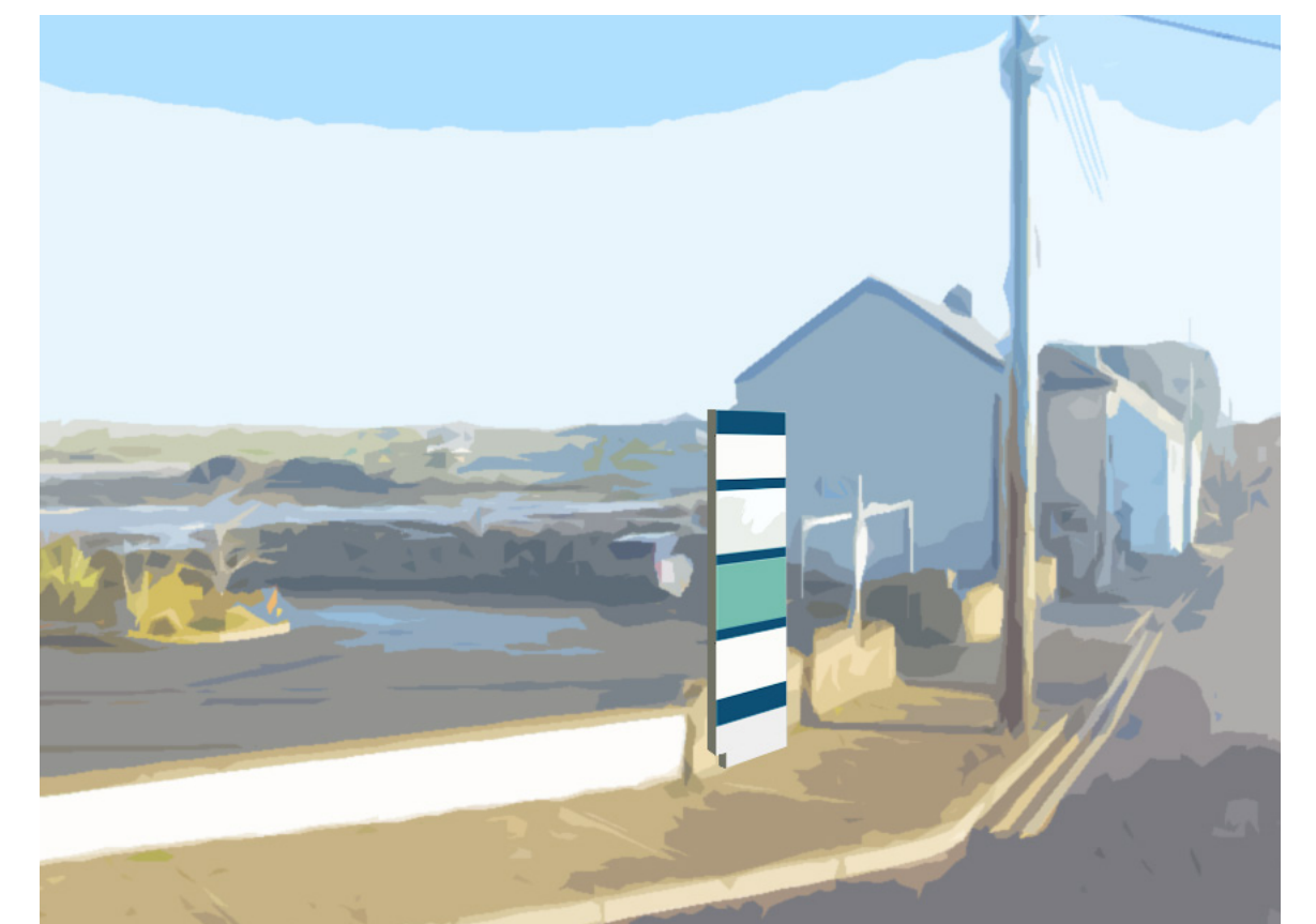
D6 - West End Bus Stop