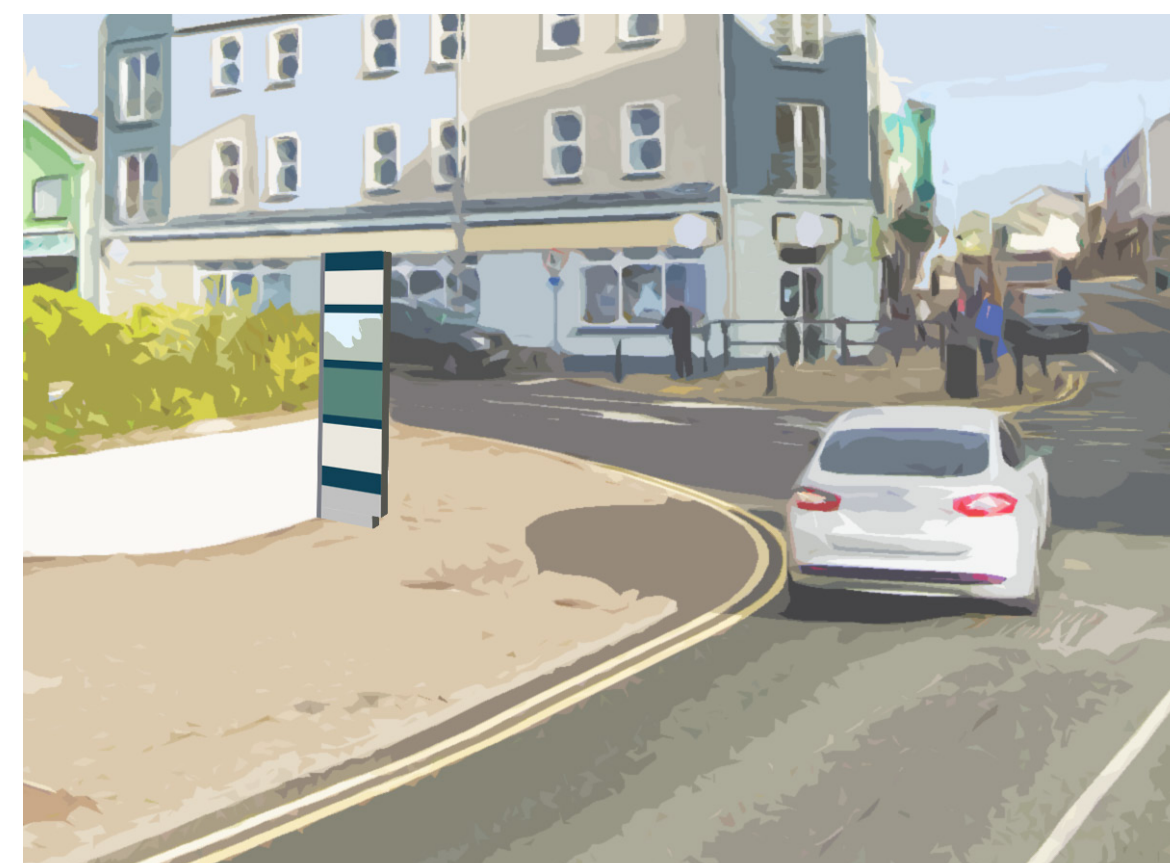
D4 - Tourist Office