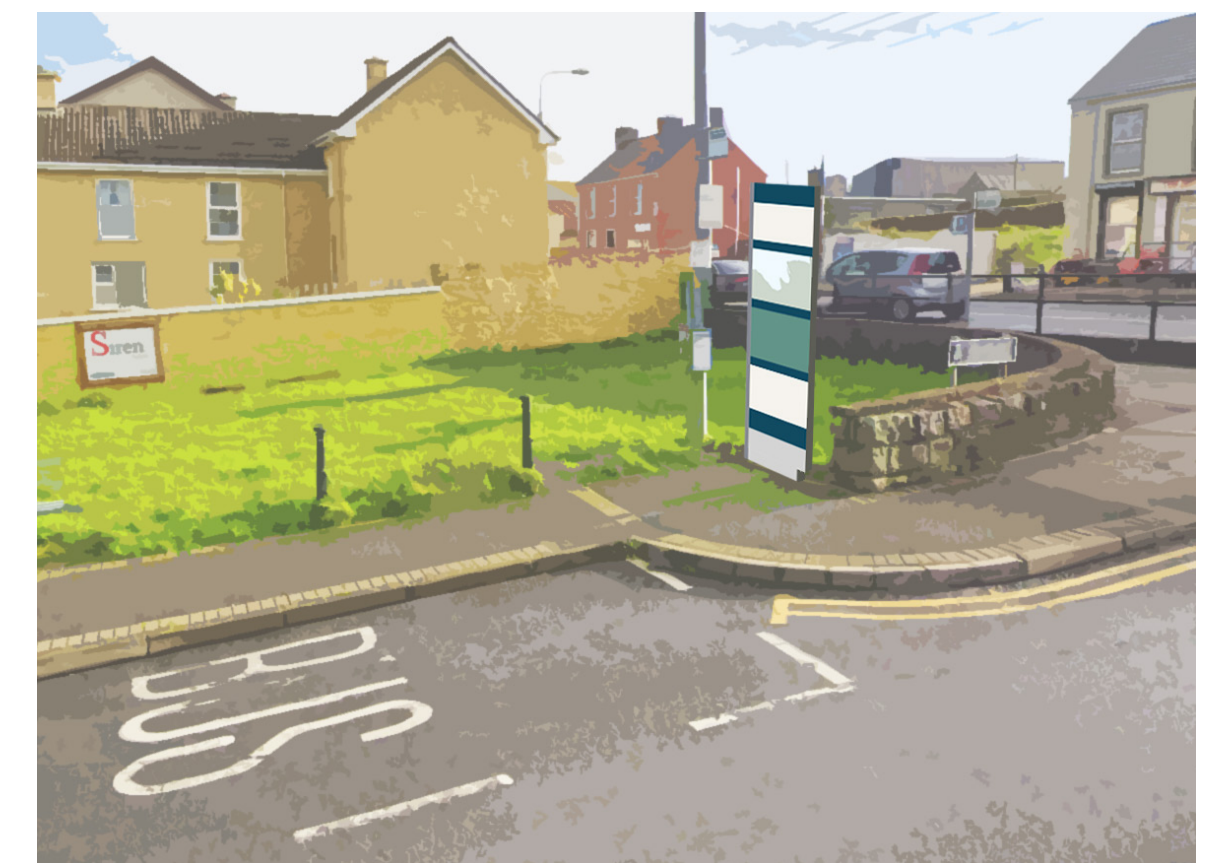
D2 - Astoria Road Bus Stop