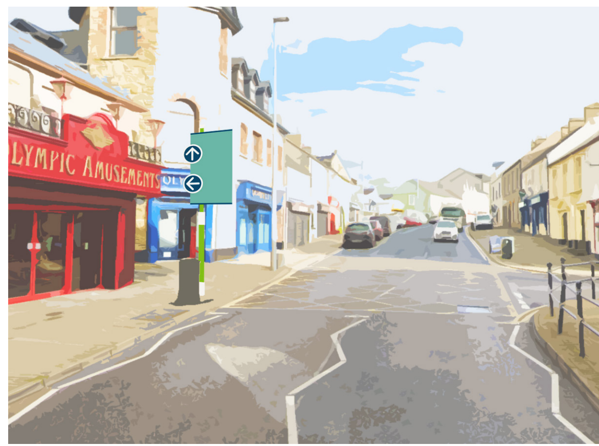
B7 - Rennison's Lane (Main Street)