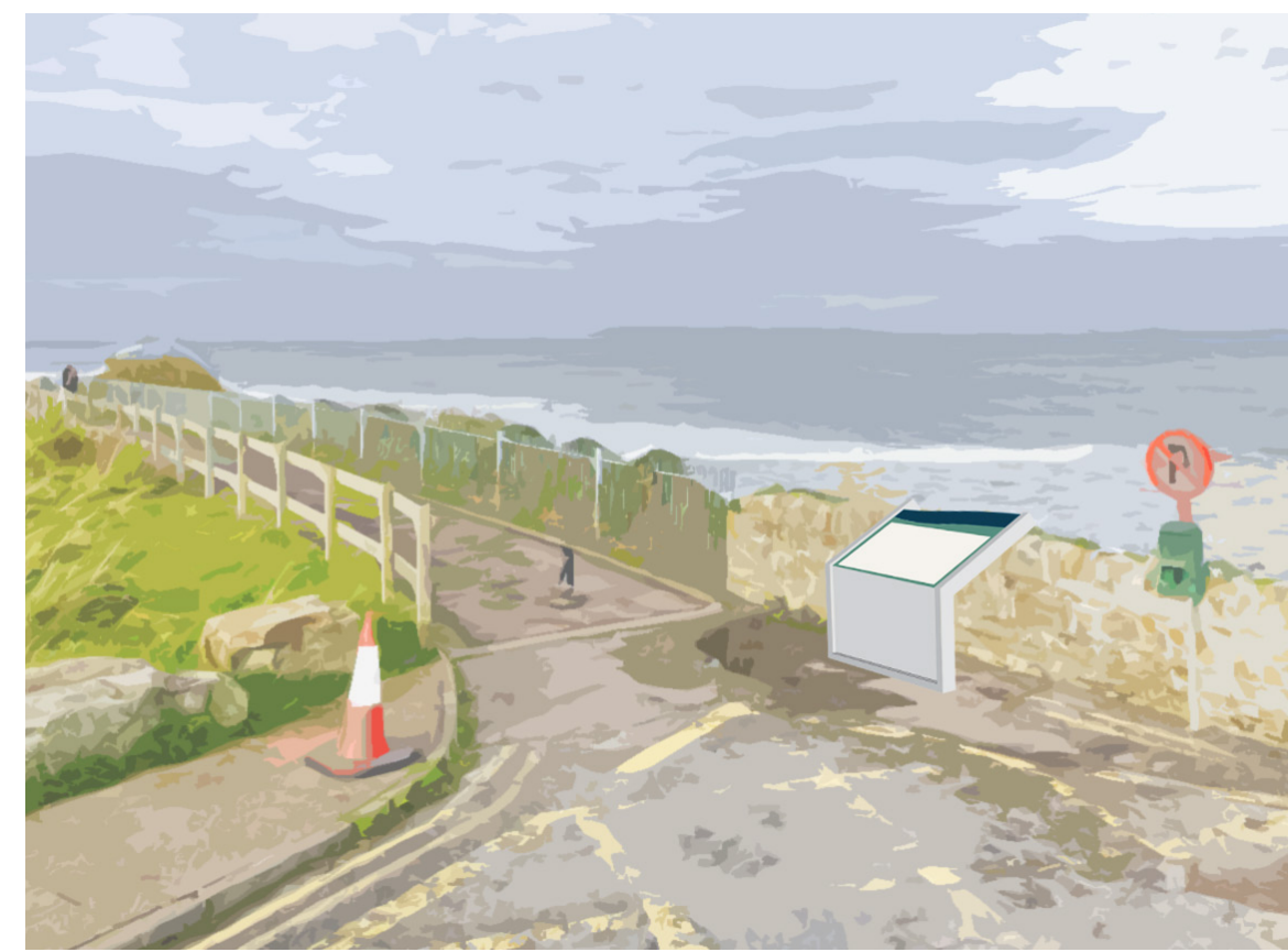
C7 - Nun's Pool